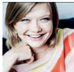
Alina Ibragimova

Alina Ibragimova violin Cédric Tiberghien piano Beethoven Violin Sonata No. 9 in A Op. 47 'Kreutzer' Janáček Violin Sonata