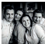
Škampa Quartet

Škampa Quartet Jakub Fišer viola Beethoven String Quartet in F Op. 18 No. 1; String Quintet in C Op. 29