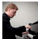
Tim Horton

'You have no idea how it feels to our kind when one always hears a giant marching along behind' – Brahms on Beethoven