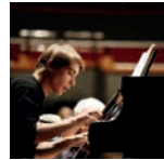
Cédric Tiberghien

Cédric Tiberghien piano O/Modernt Soloists Hugo Ticciati violin