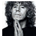
Steven Isserlis

Beethoven Cello Sonata in F Op. 5 No. 1; Cello Sonata in A Op. 69; 12 Variations in F on 'Ein Mädchen oder Weibchen' from Mozart's Die Zauberflöte Op. 66