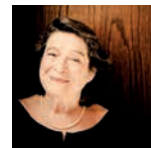
Elisabeth Leonskaja

Elisabeth Leonskaja piano Beethoven Piano Sonata No. 30 in E Op. 109; Piano Sonata No. 31 in A flat Op. 110; Piano Sonata No. 32 in C minor Op. 111